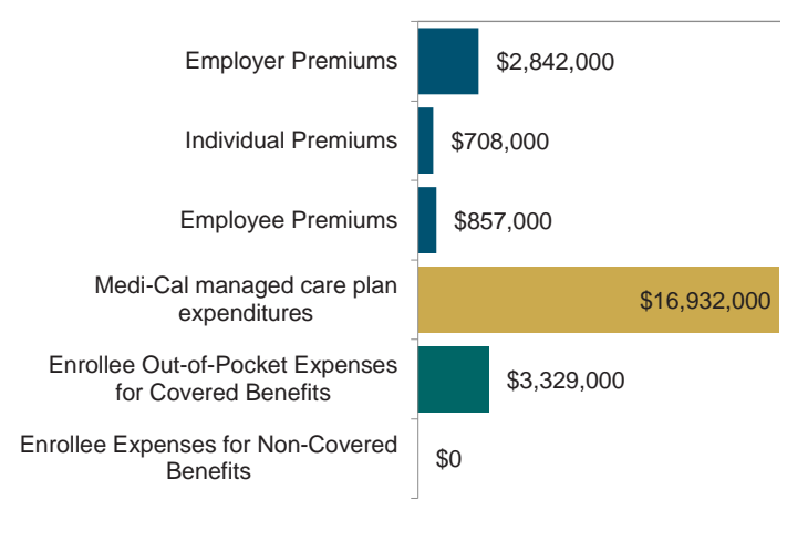
Figure 2. Expenditure Impacts of AB 2384 – net change $24,668,000

As presented in Figure 2, the expected increases in MAT and related services would increase total net annual expenditures for enrollees in DMHC-regulated plans and CDI-regulated policies. The expenditure impacts presented in Figure 2 include expected offsets for the decreased use of some services (such as inpatient days, emergency room visits, and imaging) expected for new users of MAT. Offsets related to commercial enrollees are larger due to the higher prices paid (Medi-cal managed care plans have been generally successful in negotiating or setting lower prices and so would see less of an offset impact on costs), except for services with restrictions or additional licensure requirements on suppliers like methadone and buprenorphine.