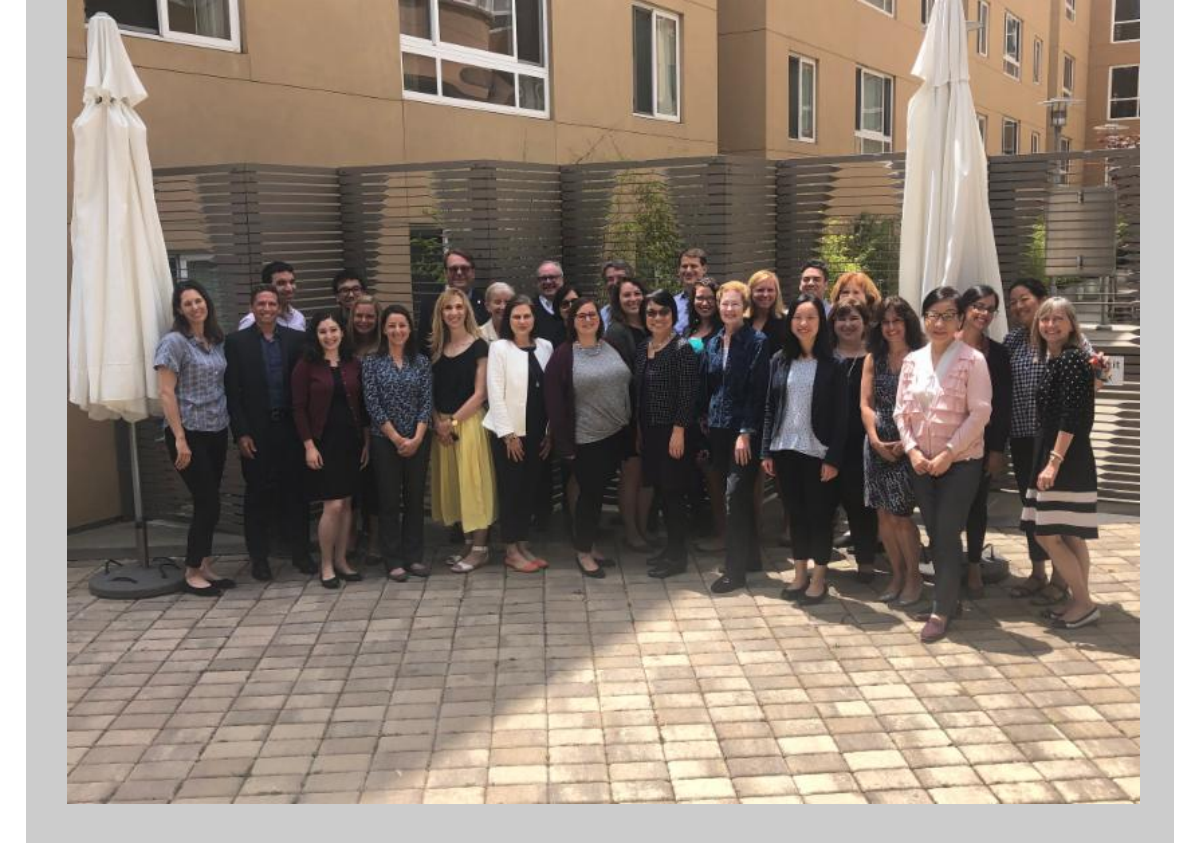
CHBRP's Faculty Task Force was welcomed to Berkeley for its semi-annual meeting on June 24, 2019.